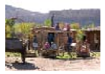
Raising the Decker Cabin